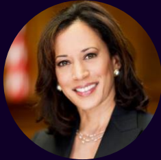
Kamala Harris (n=120)