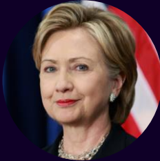
Hillary Clinton (n=40)