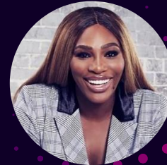
Serena Williams (n=11)

QSPOT9. Thinking of women in the public eye, who do you consider to be a role model? (OPEN ENDED QUESTION, SSRS DID NOT OFFER A LIST OF RESPONSES)