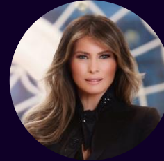
Melania Trump (n=20)