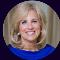
Dr. Jill Biden (n=13)