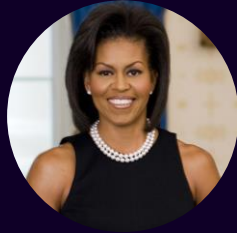
Michelle Obama (n=114)