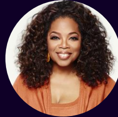
Oprah Winfrey (n=33)