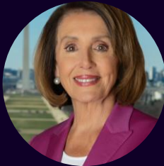
Nancy Pelosi (n=18)