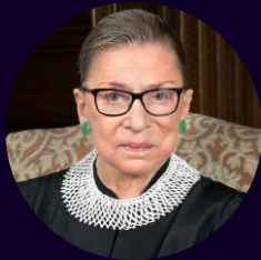
Ruth Bader Ginsburg (n=19)